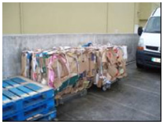
Baled cardboard awaiting collection

Balers and compactors are available in different sizes and combinations (e.g. a twin chamber baler), and can be leased, rented or bought outright. Your recovery operator may be able to work with you on the best solution to recycle your waste, as clean, segregated, baled (or compacted) waste material will attract a higher value, as opposed to low value unprocessed waste. The higher the value you can attract on your waste material, the quicker the payback period on any equipment you have acquired.