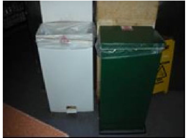
colour coded bins to collect segregated waste

To assist with segregation of waste, the following guidelines may be useful: